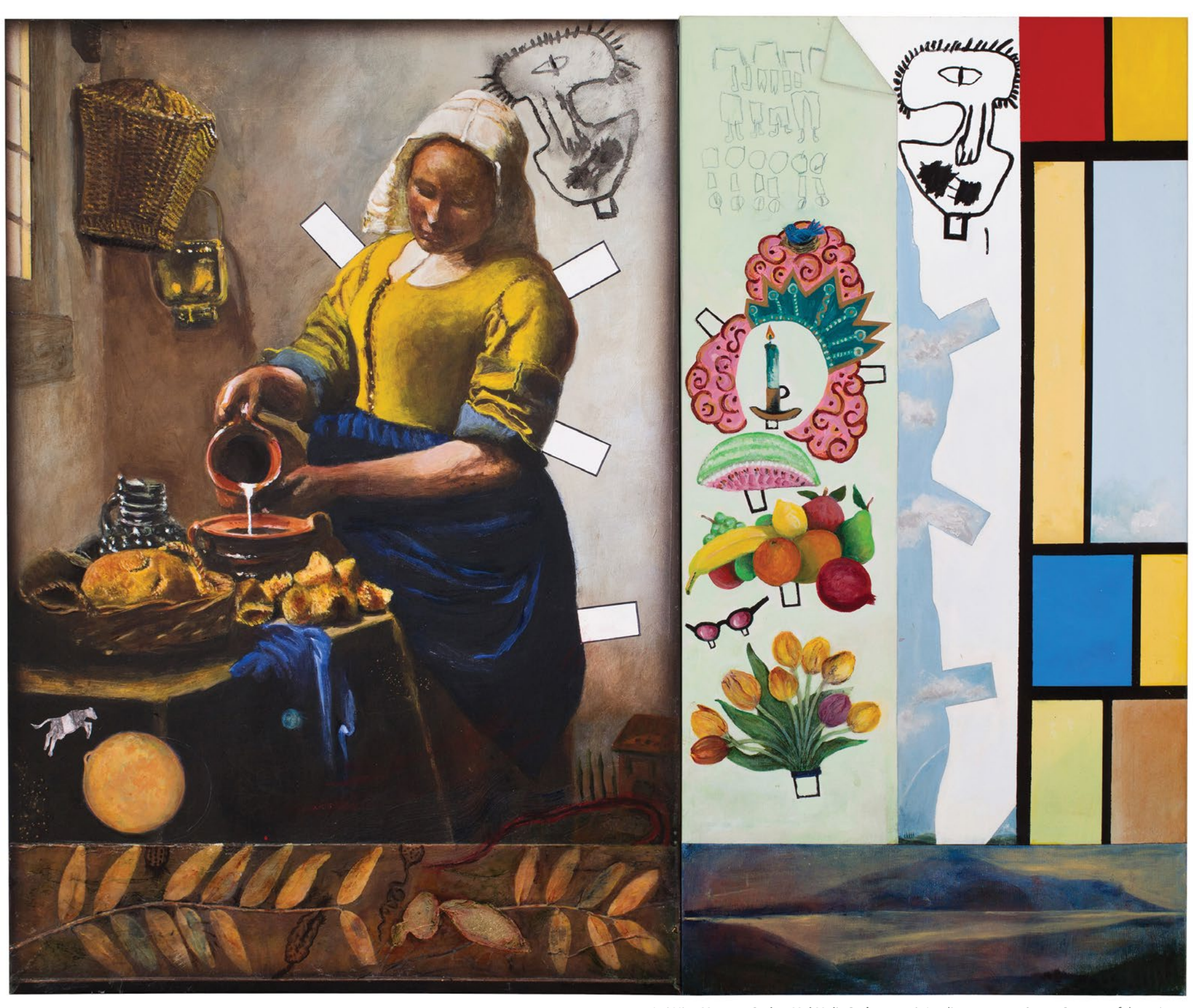
Jeri Hise. Vermeer Series: Mei Mei's Cyclops, 2016. Acrylic on canvas, 58 x 70.